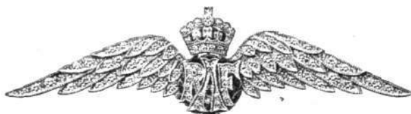
Diamond, Platinum, 18-ct. Gold and Enamel Brooch. £45 0 0 Set Rose Diamonds instead of Brilliants. £35 0 0

KINDLY NOTE THAT THIS IS THE ONLY ADDRESS OF THE GOLDSMITHS & SILVERSMITHS COMPANY, LTD.