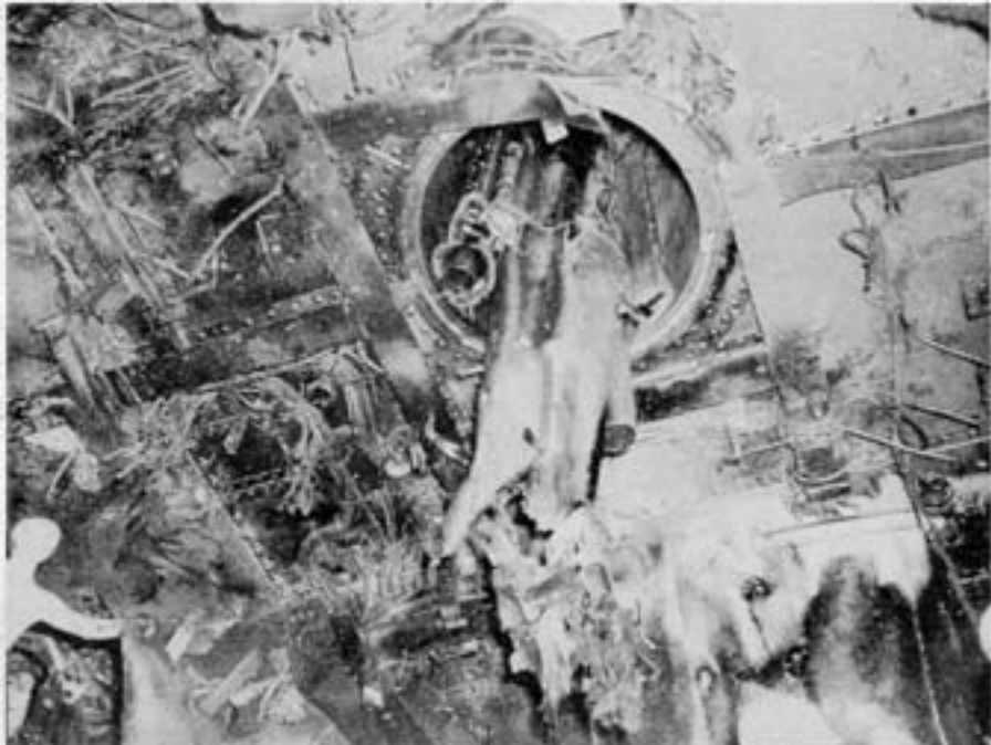
Photo 13: Looking up to the overhead (first platform level) in the lower handling room A-520-M for No. 3 turret. Note the broken powder hoists. The bulkheads and deck (second platform) were obliterated.